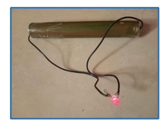
Figure 2. Application of bio battery with fruit electrolyte to LED light.